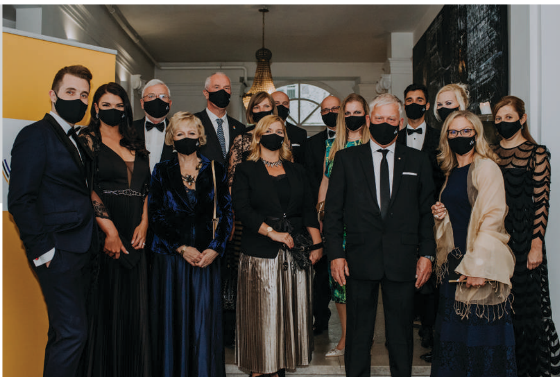
Group photo from the Charter event of RC Ljubljana International