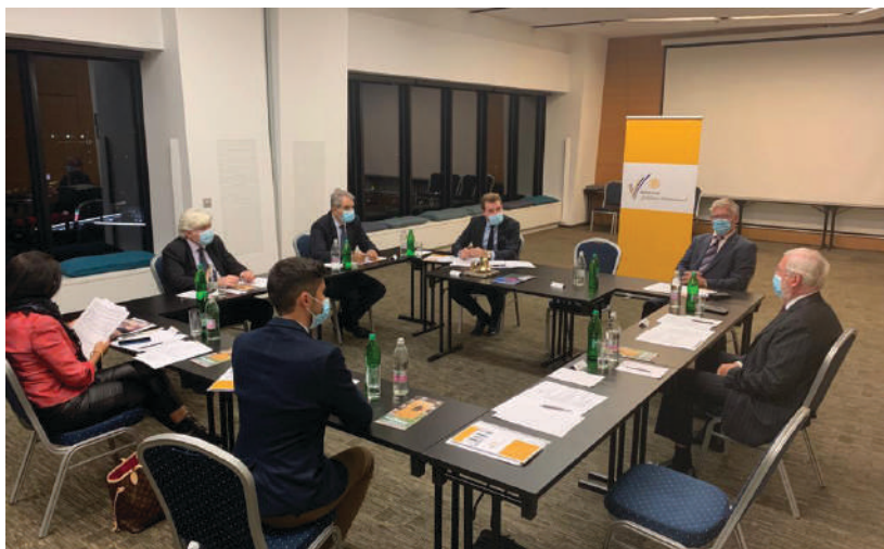
The second official club meeting at the Radisson Blu Plaza Hotel Ljubljana

The club is actively working on the new project to help the Ukrainian refugees in the similar sense as we help the Venezuelan Slovenes, and in the field of cultural connection between Slovenia and the Czech Republic. We have established partnerships with more than 10 international clubs around the world and gathered 23 club members and 9 sponsors.