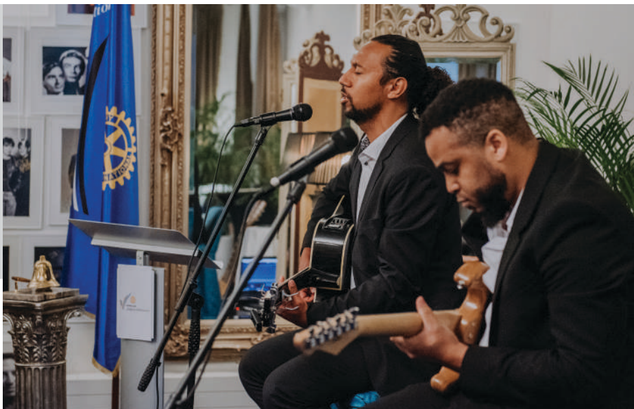
Charter event of RC Ljubljana International