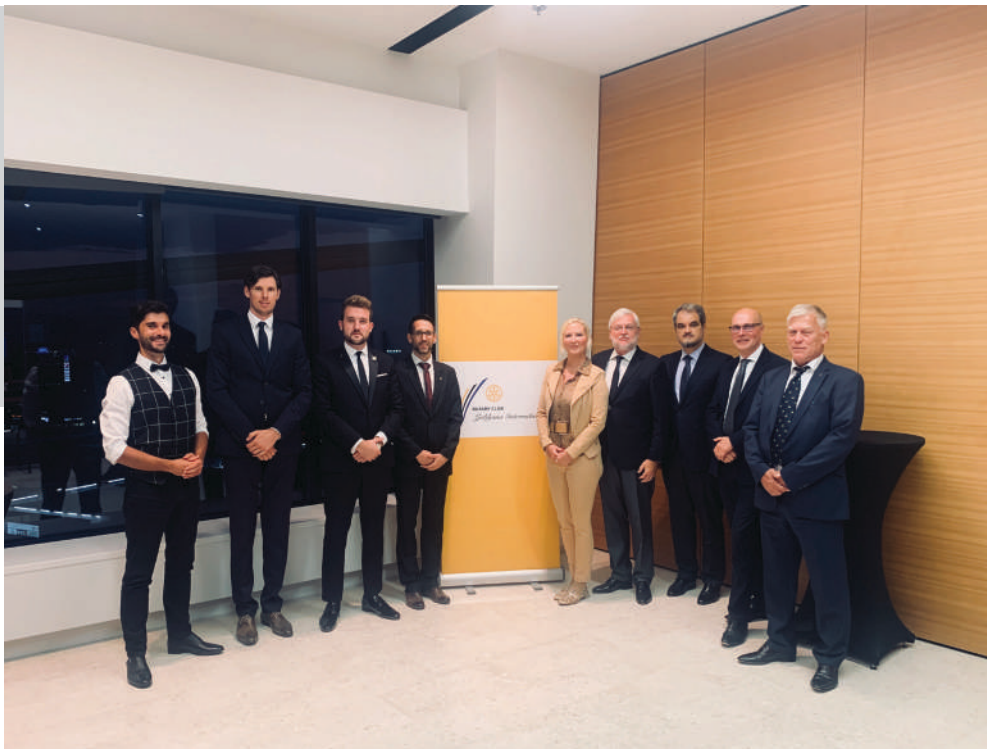
The first official club meeting at the Radisson Blu Plaza Hotel Ljubljana