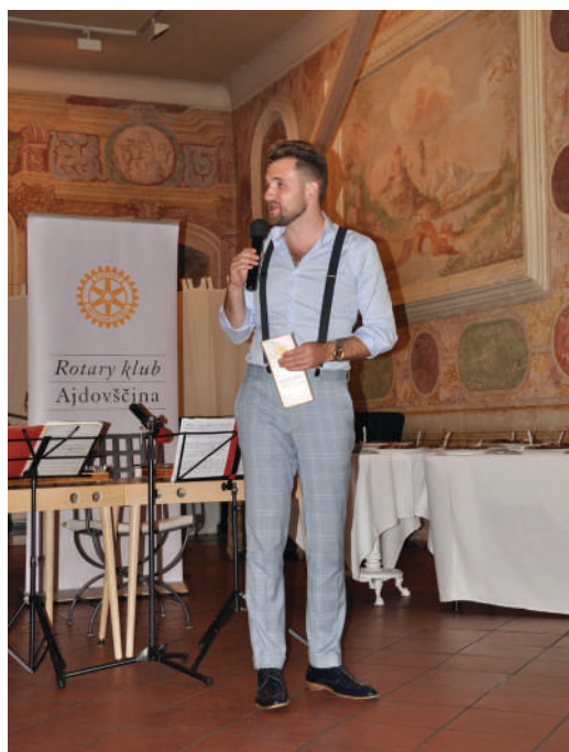
Photos from informal club meeting at Frangež Wine Estate, Caipirinha workshop, official meeting and visit to RC Ajdovščina