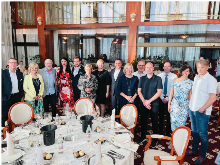
RC Ljubljana International members at the Wine Gourmet Evening in Hotel Bernardin