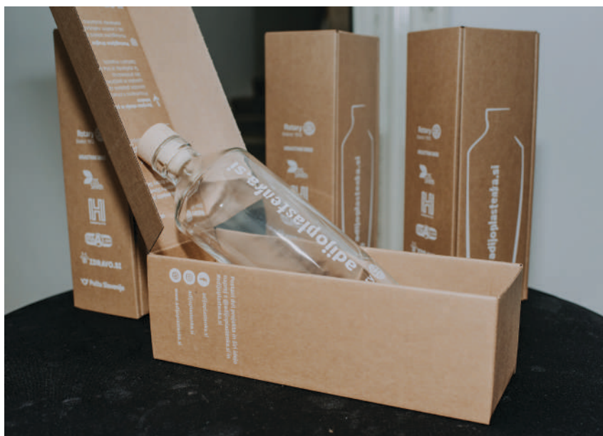
The GlassyClassy.eco bottle