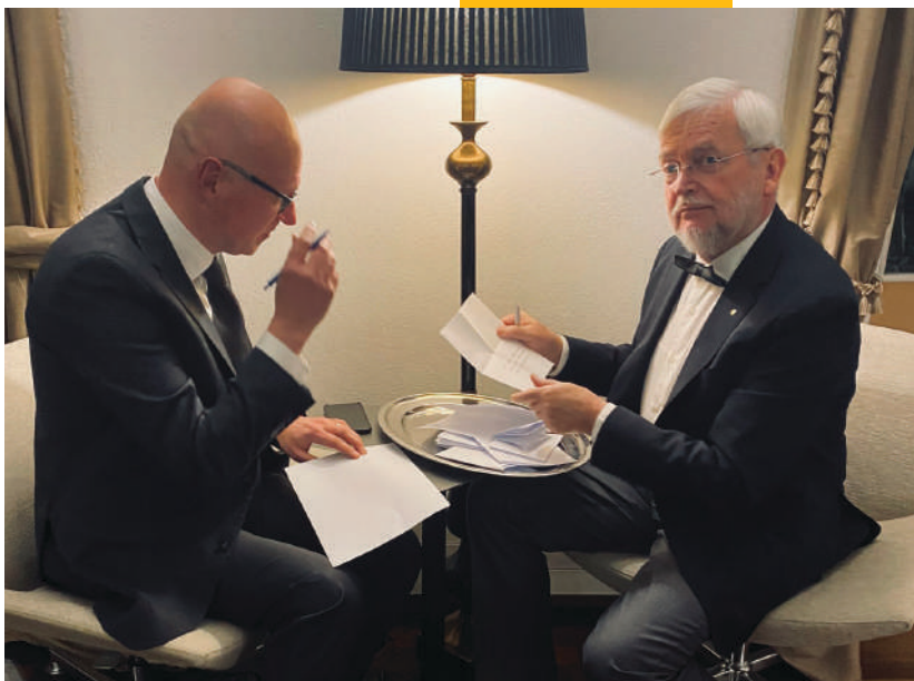
Voting for Paul Harris Award, dinners after RC official meetings