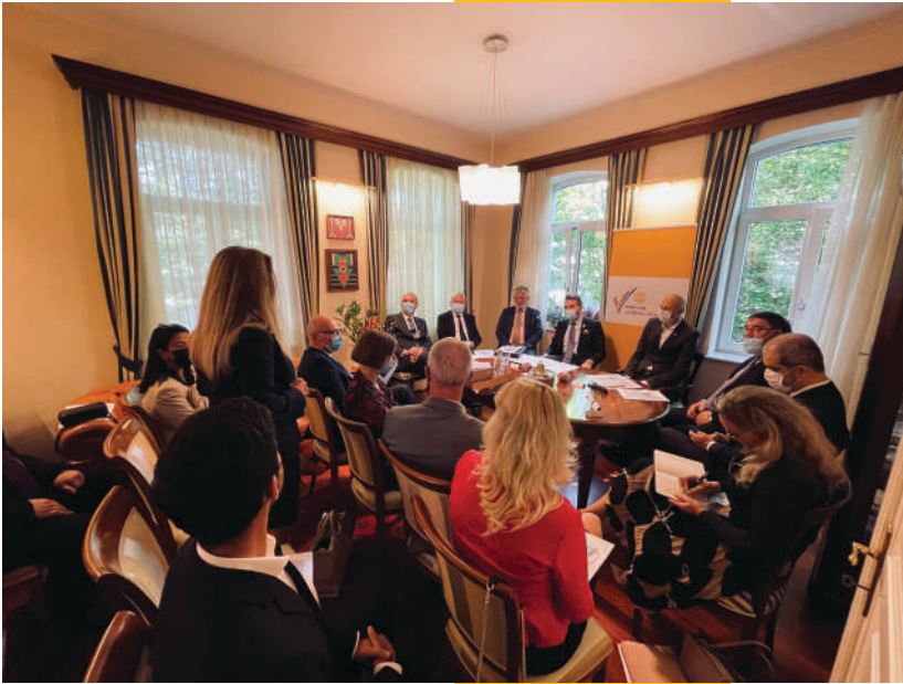
RC official meeting at the Residence of Brazilian Ambassador to Slovenia