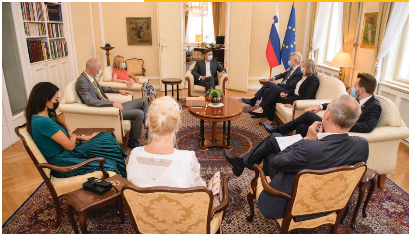
With President of the Republic of Slovenia, Mr. Borut Pahor